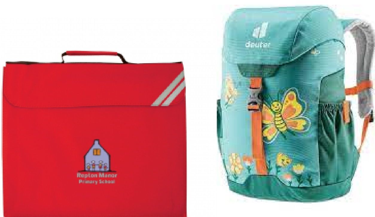
A book bag or a rucksack