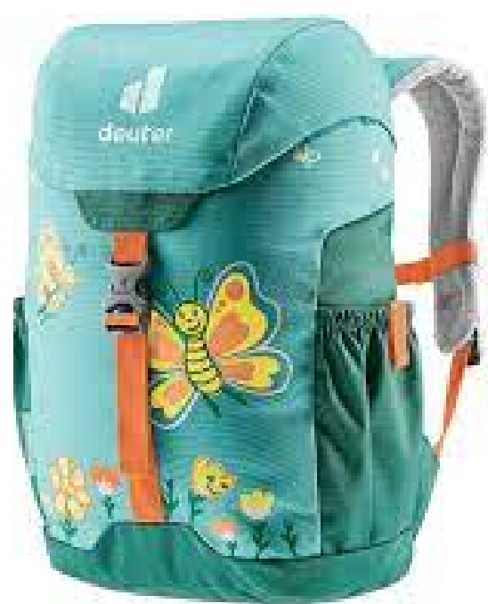
A book bag or a rucksack